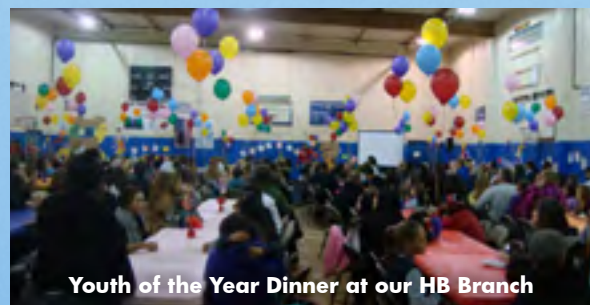
Youth of the Year Dinner at our HB Branch