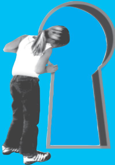
Table sales, items to be included in our silent and voice auctions, and sponsorships are needed if we are to meet our goals. With your help, the Boys & Girls Clubs of Huntington Valley can continue to be a positive place for kids, where 5,500 “at risk” youth from our community learn that it’s what’s inside that matters , and that what’s inside them is great!

The Benefit Dinner & Auction will be held on October 15, 2004 at the Hyatt Regency Huntington Beach Resort & Spa. Our goal for this exciting event is to raise $350,000! $350,000 will help provide a safe and loving environment for kids to grow, where kids are encouraged to fulfill their potential, and where kids can learn that — It’s what’s inside that matters.