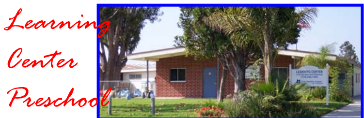
Learning Center Preschool