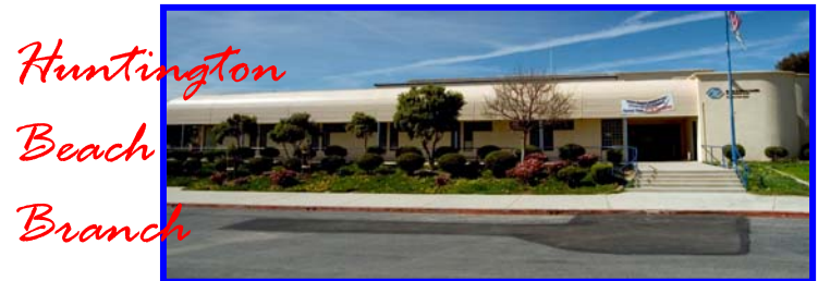
Huntington Beach Branch