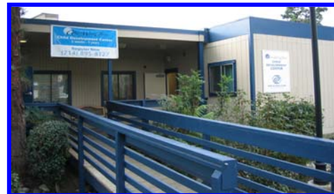
GWC Child Development Center