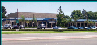
Kingston Branch, Fountain Valley