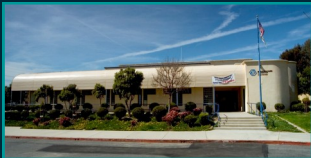
Huntington Beach Branch