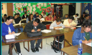
Twilight Education Project