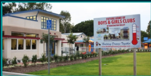
Robert Mayer Child Development Preschool