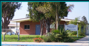
Learning Center Child Development Preschool